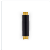
WS41216-BK/GL Black/Gold Leaf